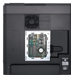
Dell 2150cn/cdn rear view