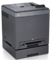
Dell 2150cn/cdn colour laser networked printers with optional 250 sheet drawer