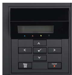
Dell 2150cn/cdn control panel