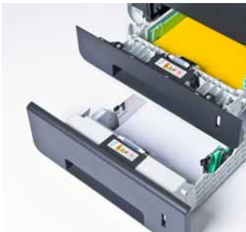
Add a second tray for more convenient paper handling.

SSL encryption. Although documents are sent from computer to printer within seconds, this is long enough for the information to be hacked. SSL prevents this by encrypting the data you send over the network.