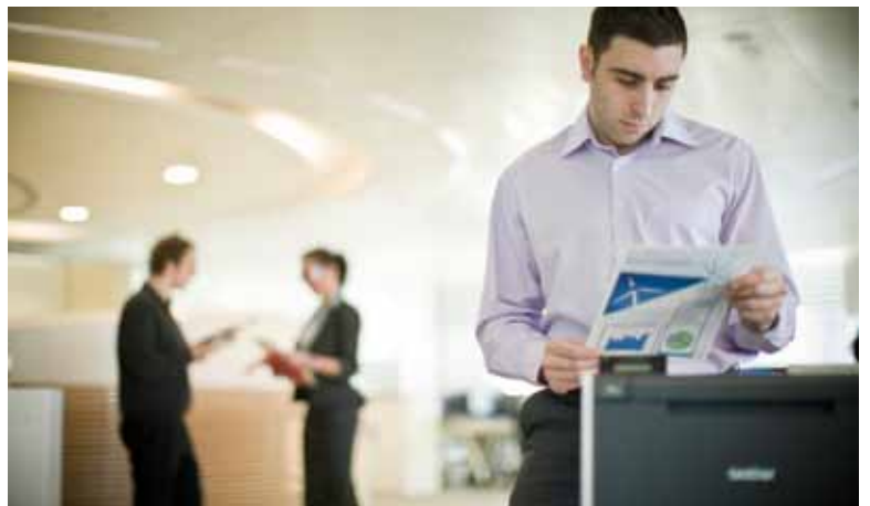
Ideal for busy offices: share resources via your existing network.