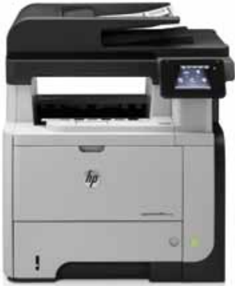
HP LaserJet Pro MFP M521dw

Finish jobs faster, produce high-quality documents, and make scanning and sharing simple. Get set up and connected quickly. 3,9 Send quick commands from an intuitive color touchscreen. Easily conserve resources and recycle used cartridges. 11