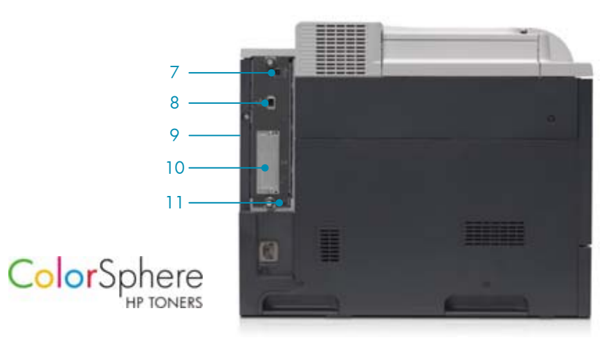
Right side view