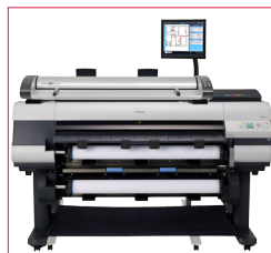
IQ Quattro 44 MFP Repro