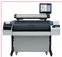
SD 36 MFP Repro

A Contex MFP Repro bundle includes a scanner, intuitive Nextimage REPRO software for scanning and copying, and a high stand. Also available with low stand for side-by-side solutions.