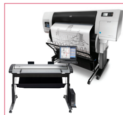
Low stand version available for side-by-side