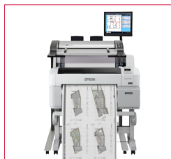
IQ Quattro 24 MFP Repro