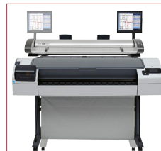
A good ergonomic environment for left- as well as right-handed operation

Contex Head Office Phone: +45 4814 1122 info@contex.com