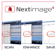
Awarded Nextimage software to ensure image quality for both archival and printing