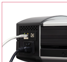
Copy to unlimited number of printers via network or USB