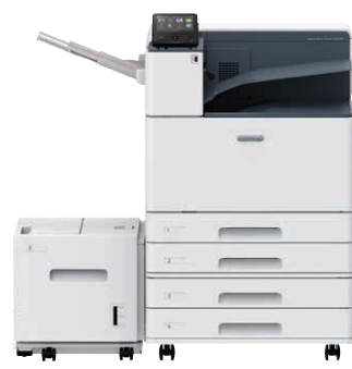
With 2 Tray Module and HCF B1 and Side Tray