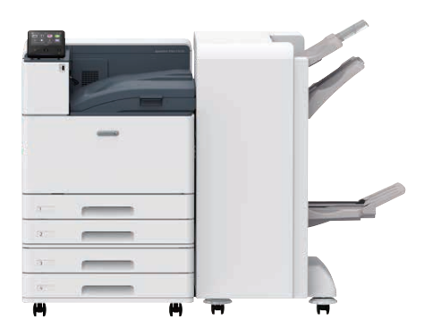
With 2 Tray Module and C3 Finisher with Booklet Maker

Staple capacity of up to 50 / 65 sheets* / Punch* / Saddle Staple / Single Fold