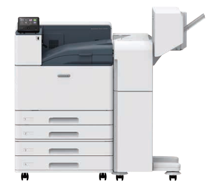
With 2 Tray Module and Finisher-B3 and Booklet Maker Unit Staple capacity of 50 sheets / Punch* / Saddle Staple / Single Fold