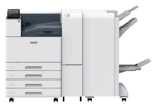
With 2 Tray Module and C3 Finisher with Booklet Maker and Folder Unit CD1

Staple capacity of up to 50 / 65 sheets* / Punch* / Saddle Staple / Single Fold