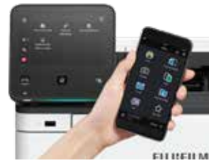
Print from mobile devices