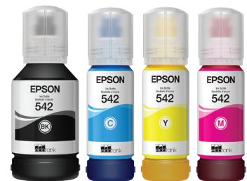
Replacement pigment ink bottles

Security features and easy connectivity — full suite of embedded features protects your data; connect wirelessly with Wi-Fi Direct ®5 ; also features voice-activated printing 6