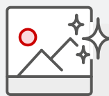
PROFESSIONAL PRINT & LAYOUT