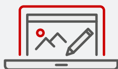
DIGITAL PHOTO PROFESSIONAL