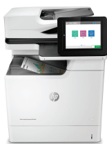
HP Color LaserJet Enterprise MFP M681dh