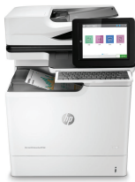
HP Color LaserJet Enterprise Flow MFP M681f

This HP Color LaserJet MFP with JetIntelligence combines exceptional performance and energy efficiency with professional-quality documents right when you need them—all while protecting your network with the industry's deepest security. 1