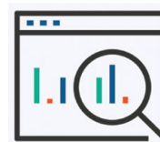
Cost & Usage Analysis