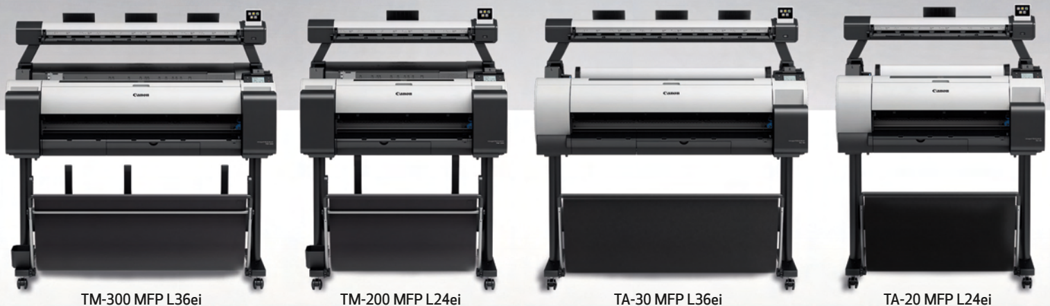
TM-300 MFP L36ei

Free Layout Plus: Nest, tile, and create custom layouts before printing your files with this print utility. Use the Plug-in feature to print directly from Microsoft office programs.